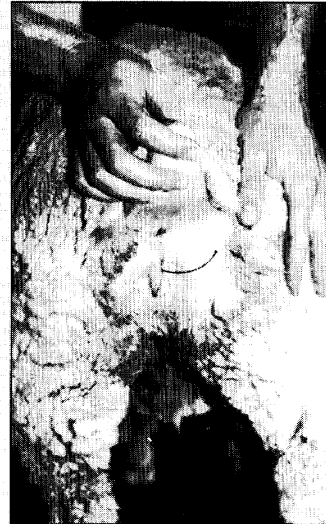
3. Inserted EAZI-breed CIDR G