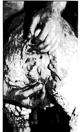
4. Pull to remove.