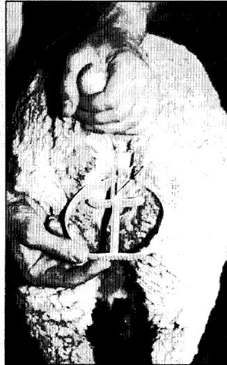
2. Depress plunger